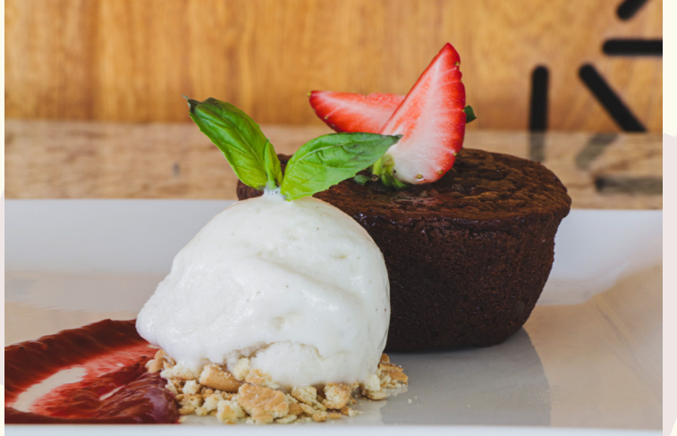
Chocolate brownie with vanilla ice cream -$158.00